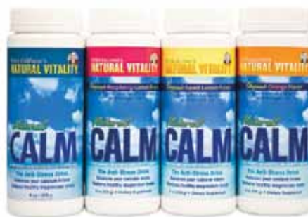
Natural Calm is available in original, organic raspberry-lemon, organic sweet lemon and organic orange flavors in 8 oz and 16 oz sizes. Original Natural Calm and organic raspberry-lemon are also available in single-serving packs.

Unless calcium and magnesium are properly balanced, magnesium becomes depleted (too much calcium can deplete magnesium levels). This can result in an inability to quickly recover from stress and can itself be a source of stress.